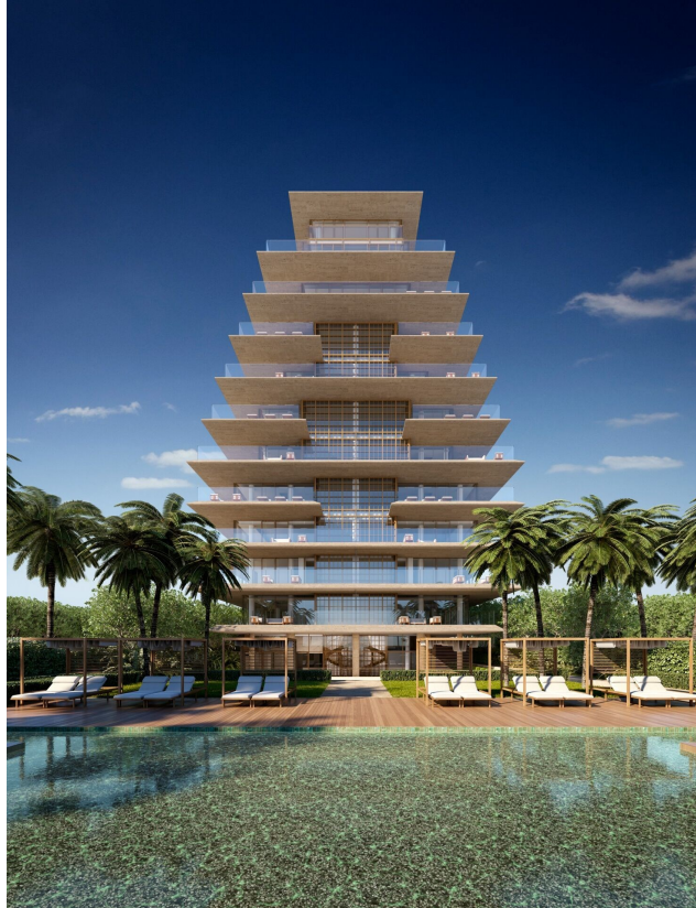
Arte, image via Antonio Citterio