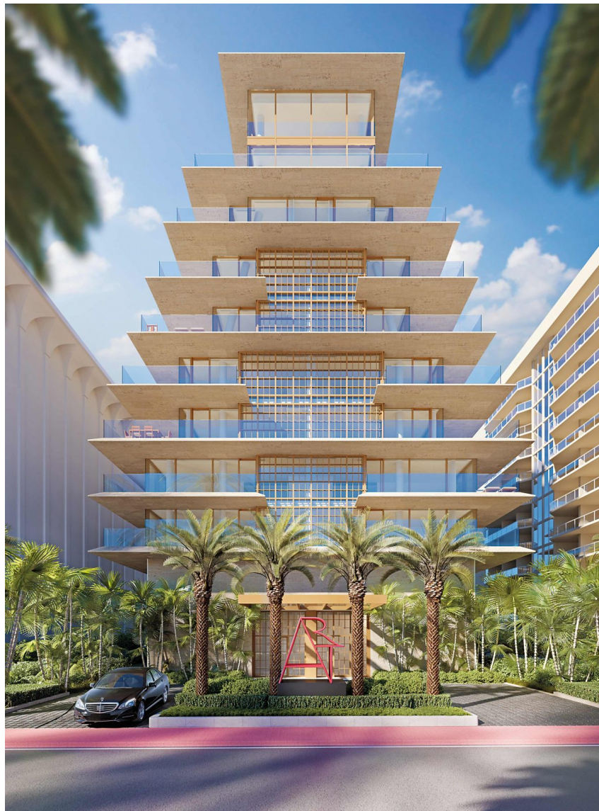
Arte, image via Antonio Citterio

Italian architect and designer Antonio Citterio 's first United States project has now entered sales. Located at 8955 Collins Avenue in Surfside, a sought-after area just north of Miami Beach, Arte will contain 16 luxury homes across its 12-storey articulated frame.