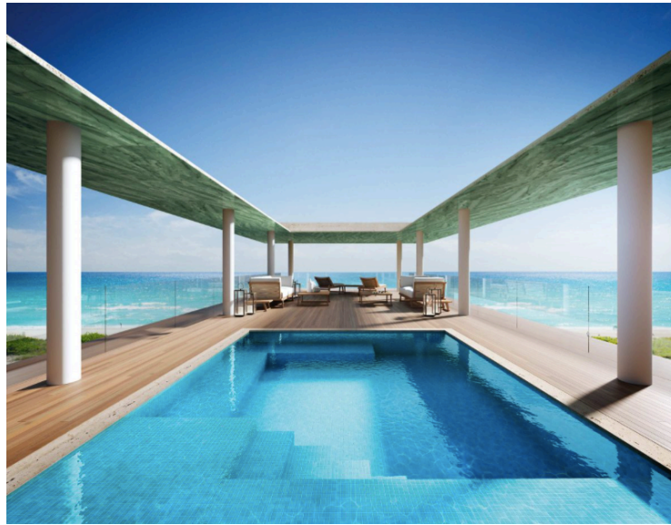
Rooftop pool, image via Antonio Citterio

An exhaustive amenities package includes a resort-like health and wellness offering that includes a 75-foot-long indoor swimming pool, an outdoor swimming pool, a rooftop tennis court, fully-equipped fitness centre and yoga studio, sauna and steam room, and a meditation pond. Additional on-site conveniences include a children's playroom, residents' lounge, and catering kitchen.