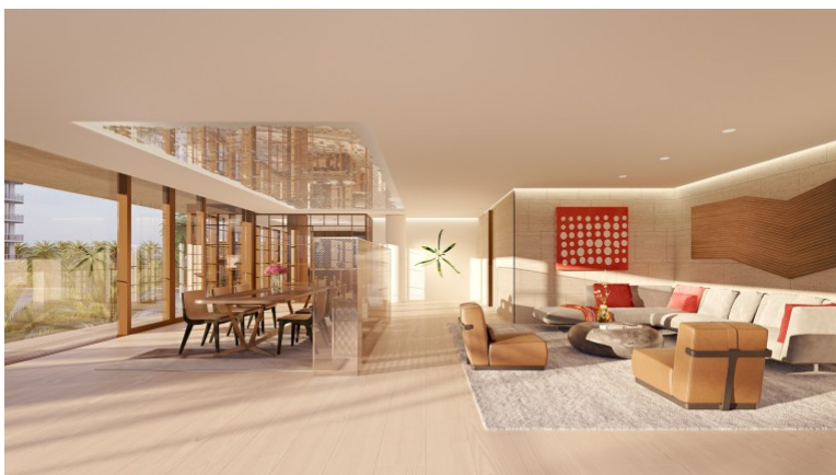
Level 15 interior.