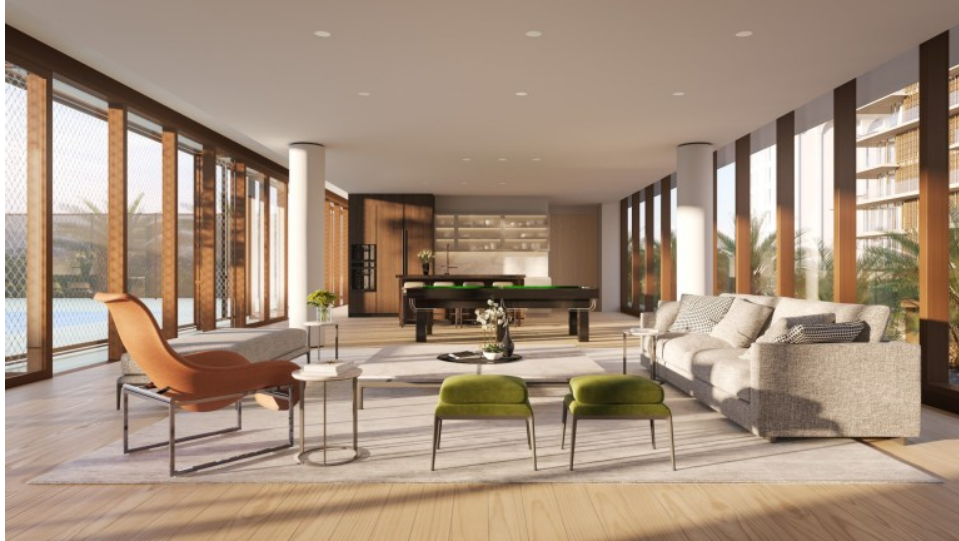
West building roof lounge next to tennis court.