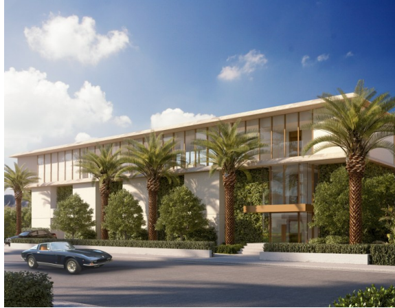
West Building, across Collins Avenue from the main tower.