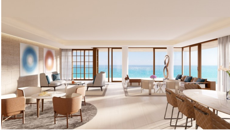
6th Floor Living Room.