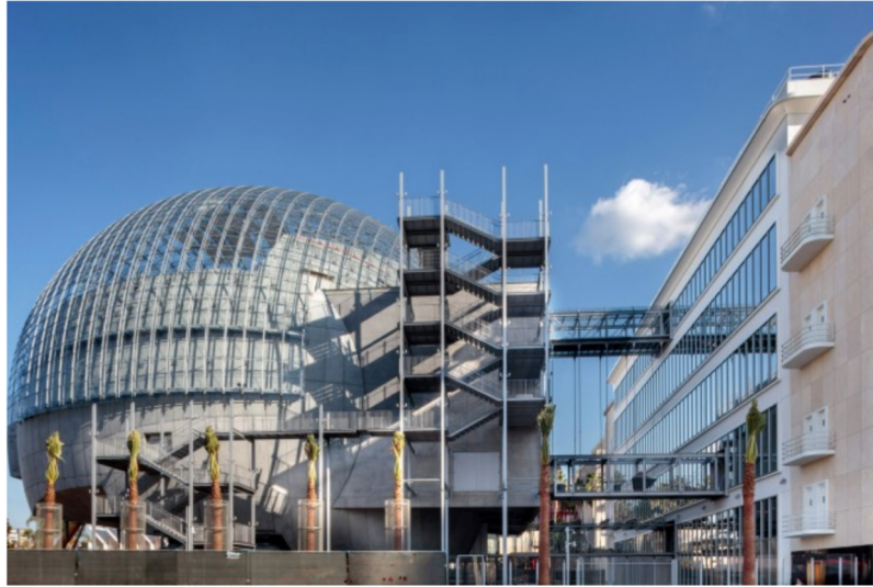
Renzo Piano Building Workshop: Academy Museum of Motion Pictures, Los Angeles

“ NOW THAT THE BIRCHES HAVE BEEN PLANTED ON THE ROOF OF THE DEPOT, THE CIRCLE IS COMPLETE. WE HAVE TRANSFERRED THE PARK AT 35 M ALTITUDE TO THE TOP OF THE BUILDING, WITH A SPECTACULAR VIEW ON THE CITY - WINY MAAS, MVRDV ”