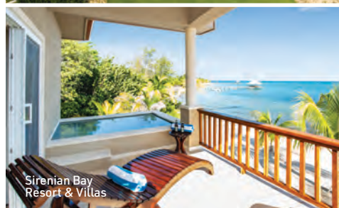
Sirenian Bay Resort & Villas