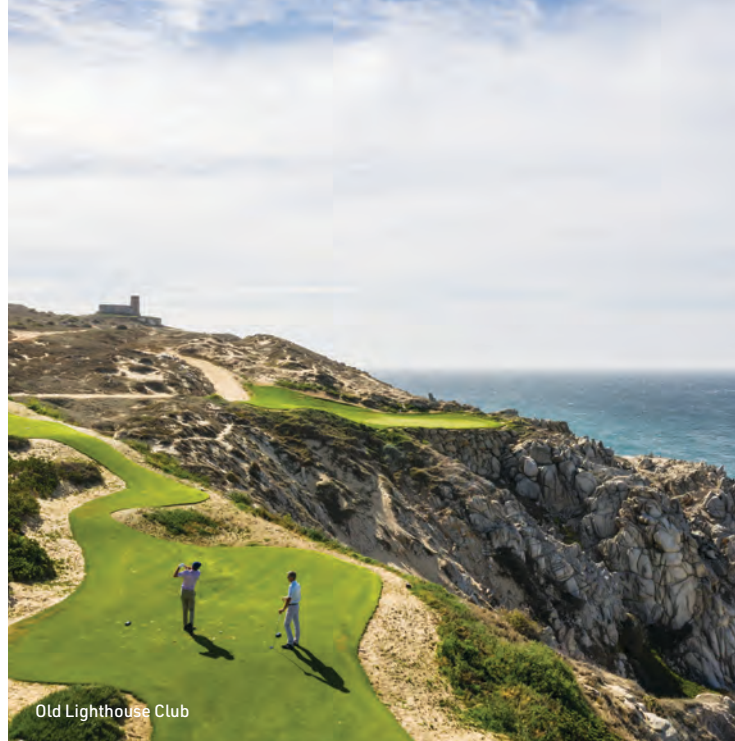
Old Lighthouse Club