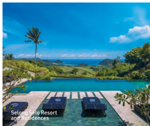
Selong Selo Resort and Residences

Island. The luxurious three- to five-bedroom residences range from 3,300 to 6,600 square feet with panoramic ocean views and are just