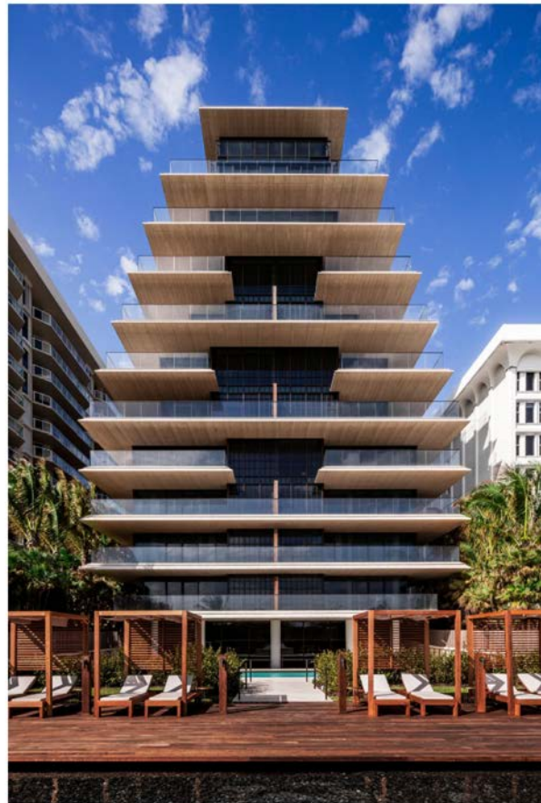
Exterior view of Arte by Antonio Citterio, a 16-unit oceanfront condo in Miami Beach. Kris Tamburello