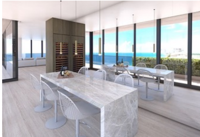
Arte Surfside Wine Lounge

Additionally, the developers designated expansive indoor/outdoor entertaining spaces on the top level, providing the perfect setting for al fresco, waterfront dining. As the only available residence at Arte with a terrace wrapping 360 degrees around the property, Villa Nove offers a jaw-dropping 300 feet of oceanfront views and an unmatched opportunity to live luxuriously in Miami.