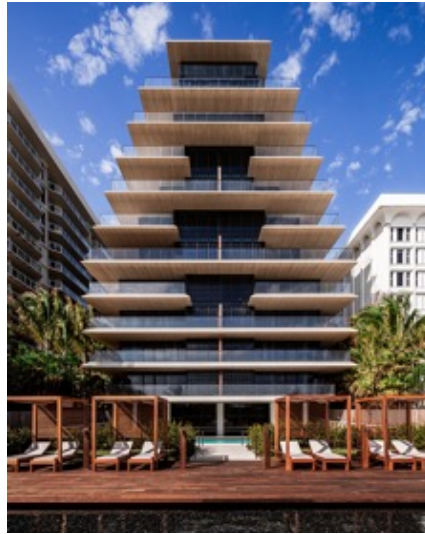
Hero II, building designed by Antonio Citterio

A spectacular $38 million conceptual penthouse just hit the market at Arte , Miami's most exclusive oceanfront condominium. Designed by master Italian architect Antonio Citterio, Arte is a magnet for the rich and the famous for its small scale, first-class service and incredible lifestyle programming and amenities, where the experience can be likened to that of a private club.